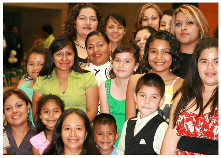
"The FLI challenged me to get out of my comfort zone and learn something new. This experience empowered me to take action to transform my life."